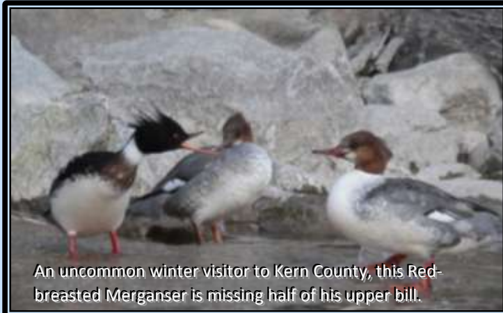
An uncommon winter visitor to Kern County, this Red-breasted Merganser is missing half of his upper bill.