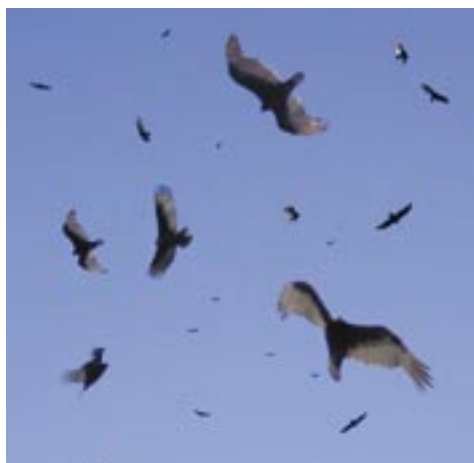
A kettle of vultures takes off from the Kern River Preserve in September 2002.

Ten years and a quarter of a million Turkey Vultures later the Kern Valley Vulture Watch is continuing for its 10 th season 1 September 20 October 2003. This all-volunteer scientific research project studying migrating Turkey Vultures