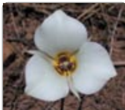
Leichtlin's Mariposa Lily was found all over Cherry Hill Rd in the Sequoia National Forest.

Even now in the first days of September there are still mountain areas with extended blooms of spring annuals and perennial buckwheat. The blooms of sunflowers and aster family shrubs in autumn guarantee that the beauty of