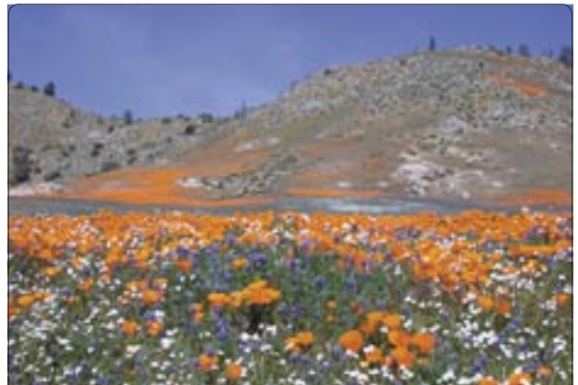
Fields upon fields of wildflowers awaited the adventurous this spring, like this field of poppies, lupine, and popcorn flowers on Jawbone Canyon Rd in Kelso Valley. Photo by Alison Sheehy © Nature Ali.

http://www.natureali.com/wildflowers.htm