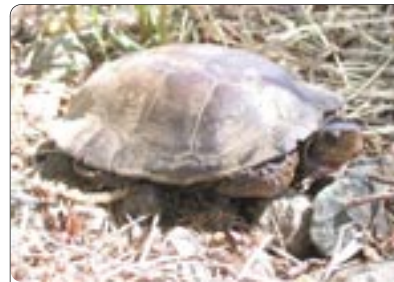
A rare Southwestern Pond Turtle- Clemmys marmorata pallida , makes an appearance on the Kern River Preserve during the BioFest.

For the ninth year in a row the Kern River Preserve