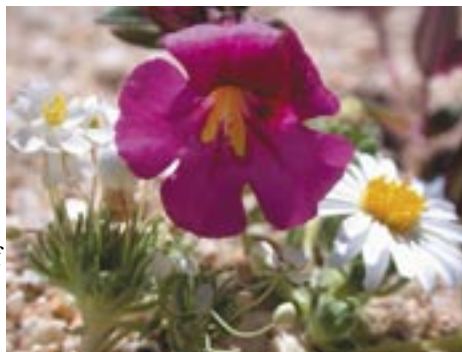
Pygmy poppy, Biglow's monkeyflower, and desert star were just three of the many natural prizes for a beginning wildflower hunter.

The Kern River watershed was the first to be noted, quickly followed by nothing short of a spectacular displays in Short Canyon and Jawbone Canyons in the NW Mojave Desert.