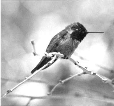
Hummingbird photo & art by Alison Sheehey