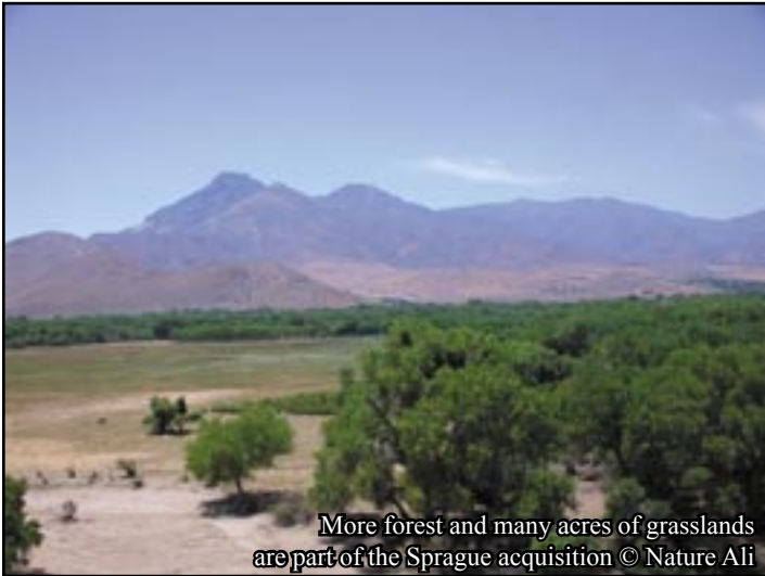
More forest and many acres of grasslands are part of the Sprague acquisition

been rehabilitated thanks to star volunteer Alan Jones.