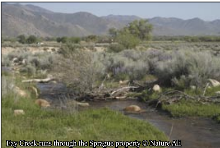
Fay Creek runs through the Sprague property

Of course the house is beautiful but not without a few problems, the roof leaks (and is a shake shingle fire hazard), some piers under the building have been undermined, and we have termites. If anyone can help us repair these defects, please contact Reed right away. §