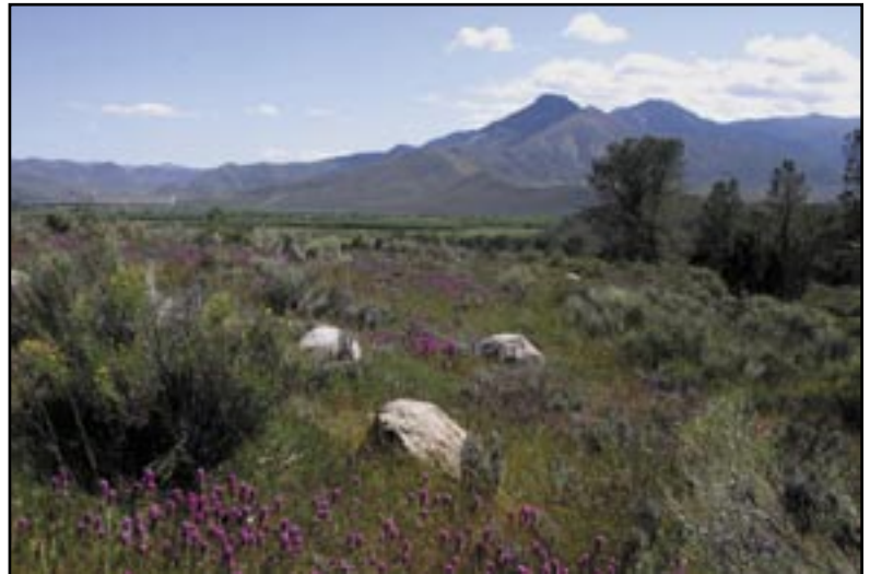
Sprague acquisition looking east from the gray pine/juniper woodland habitat along Fay Creek. Nichol Peak is the mountain in the background.