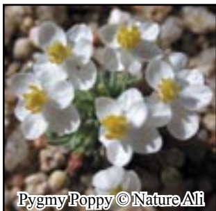
Pygmy Poppy

A tiny plant that is sensitive and found only in California was discovered on the Sprague Ranch section of Audubon's Kern River Preserve. The Pygmy Poppy, Canbya candida , is such a diminutive plant that it is easily missed. It only grows on sandy desert soil and is frequently crowded out when exotic annual grasses overwhelm an area.