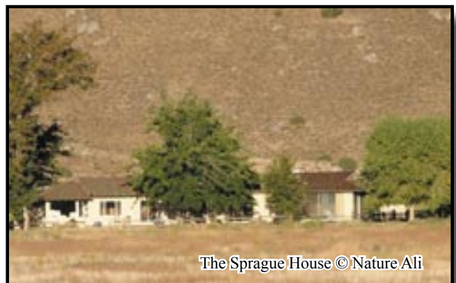
The Sprague House