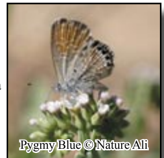
Pygmy Blue