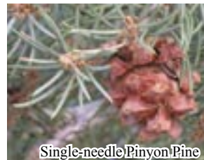
Single-needle Pinyon Pine

The June program began with a surprise, Reed Tollefson couldn't lead his walk in the river due to the fact that the normally placid river was still raging. The late spring rains assured all of the guests a wet experience right on the flooded nature trail! Several people on the walk had never been to the preserve before and were thrilled to learn about riparian forests and the role of the Kern River Preserve in protecting this endangered habitat.