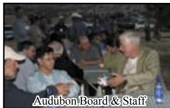
Audubon Board & Staff

The first official event at the new Sprague House was an evening barbecue with many of the people who helped put the entire deal together. The next day all staff and board members of Audubon California held a meeting in the newly refurbished house.