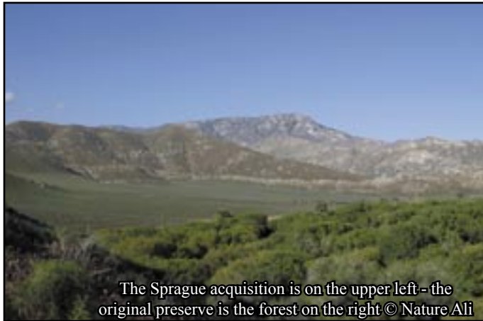
The Sprague acquisition is on the upper left - the original preserve is the forest on the right