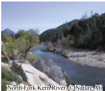
North Fork Kern River