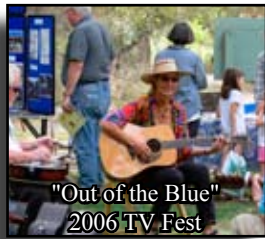
"Out of the Blue" 2006 TV Fest

Oh, what a wonderful year of festivals! Since our last newsletter we have experienced all of the year's festivals and this year was one for the record books.