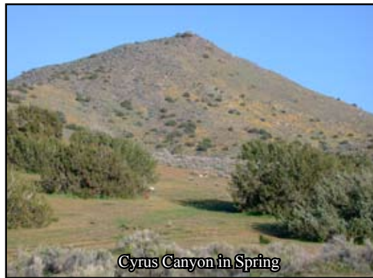
Cyrus Canyon in Spring