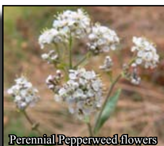
Perennial Pepperweed flowers