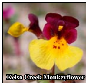
Kelso Creek Monkeyflower

for the movement of wildlife. Also by removing the potential of rural subdivision into this remote canyon we help to reduce problems for local fire agencies. This acquisition also protects one of only a few known populations of Kelso Creek Monkeyflower ( Mimulus shevockii ) a very rare and beautiful little flower (land under another significant local population has been graded for housing).