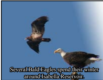
Several Bald Eagles spend their winter around Isabella Reservoir.

Preregistration for both Kern Valley counts is available via the CBC website. http://www.audubon.org/bird/cbc (click GET INVOLVED). Each field participant pays $5 to Audubon to offset the cost of compilation and printing of the CBC magazine.