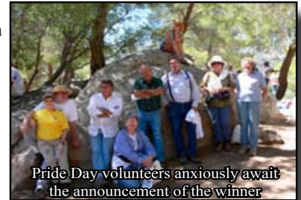
Pride Day volunteers anxiously await the announcement of the winner

Every year as part of National Public Lands Day, Kern Valley businesses and government agencies sponsor a community trash clean-up. The third Saturday in September, Friends of the Kern River Preserve gather at 7:30 a.m. to begin the task of de-littering the South Fork Valley. We work our fingers to the bone hunting for every last bit of trash. It is a challenge and our efforts normally pay off in a big way and this past year was no exception. Thirteen friends picked up a total of 181 bags of trash and the area and wildlife are so much better off for it, plus we won $250 to boot. Thanks to all of you for the great effort: