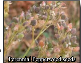
Perennial Pepperweed seeds

but as with most plants in the mustard family can flower at any time conditions are right. The flowers are small white and form dense clusters at the end of the branches. The fruit (seed housing) is a two seeded, reddish brown, slightly hairy, 1/16" long capsule.