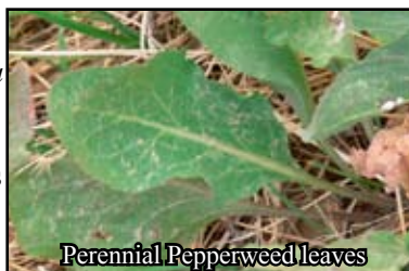
Perennial Pepperweed leaves

Read more about Perennial Pepperweed and other invasive plants at California's IPM program. http://tinyurl.com/y82jyh