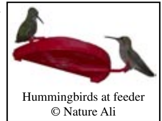
Hummingbirds at feeder

The other food we buy is wild bird seed, chicken scratch and suet cakes. The suet cakes are put out during the winter months when insects are hard to come by. The wild bird seed and chicken scratch are put out year round except when the Western Willow Flycatcher and Western Yellow-billed Cuckoo are nesting on the Preserve. We don't want to encourage any birds that might prey on the nests. The chicken scratch is scattered along the beginning of the Nature Trail so our visitors get to see birds practically underfoot.