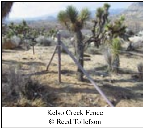
Kelso Creek Fence