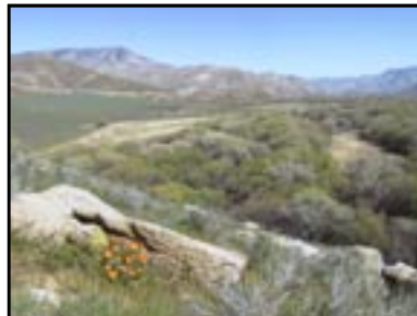
The Kern River Preserve from Migrant Corner

In the fall of 2004, Audubon Kern River Preserve applied for and received a 3 million dollar grant from the Resources Legacy Fund Foundation to support land protection in the Kern River watershed. We have potential projects including preserve expansions, ranch easements and wilderness in-holdings that we are working to protect. These private funds are critical to Audubon because we can use them strategically to leverage additional funds, to develop partnerships and new opportunities.