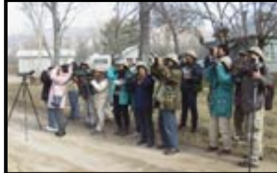
Birders from Taiwan visit the Kern River Preserve