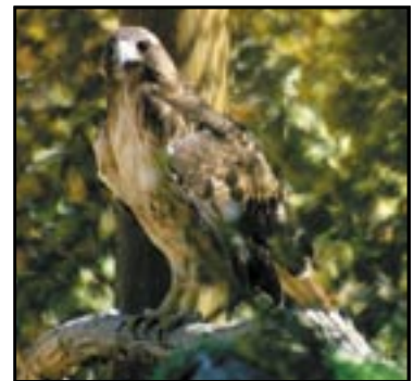
Red-tailed Hawk

Today, falconry is more of a hobby and less prevalent than it used to be. However, it has been increasing in popularity some in recent years. When Bill first started working with falcons in the late 50's he had to make his own equipment because none was available. Today construction of falconry equipment is a fine art made by craftspeople all over the world.