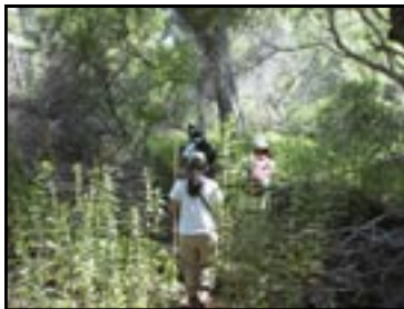
A healthy understory after fencing allowed for seasonal grazing