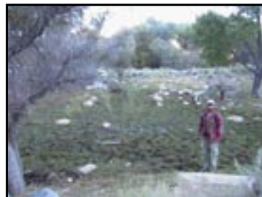
Livestock trampling at rocky point riparian area

This will help the willow and cottonwoods to increase for the benefit of a wide variety of wildlife. About 0.41 miles of creek bed at Rocky Point and 0.85 miles of creek just south of