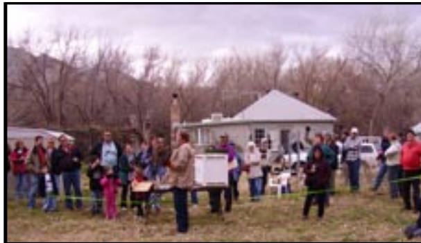
The Ancient Art of Falconry