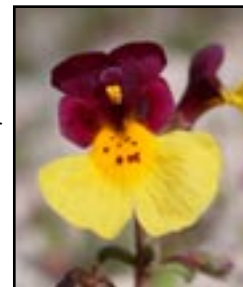
Kelso Creek Monkeyflower