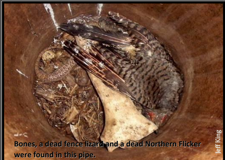
Bones, a dead fence lizard and a dead Northern Flicker were found in this pipe.