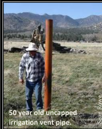
50 year old uncapped irrigation vent pipe.